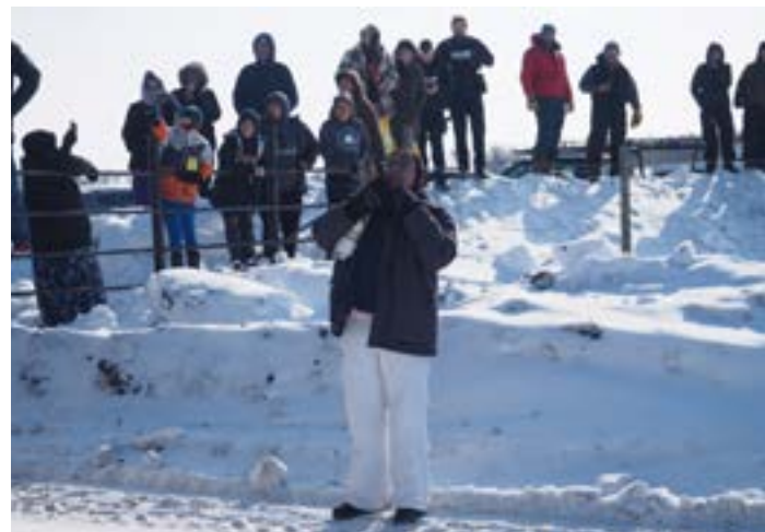
The people who came to watch.