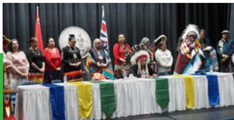
12 Samson Cree Nation Acimowin