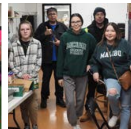
Pigeon Lake & Samson Cree Nation Family Day 2023 pictures.