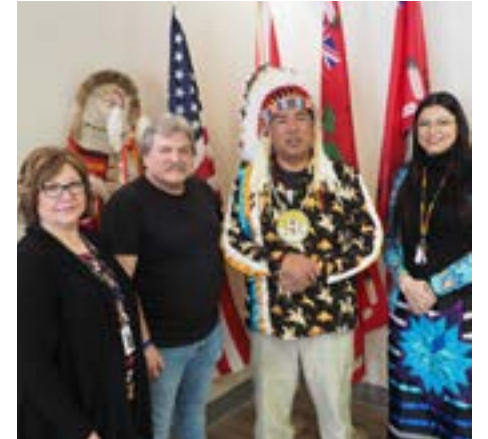
March 6, 2023. Ponoka Mayor Tom Ferguson visits local family and leadership.