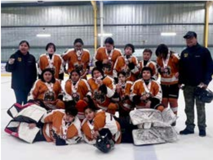
Deschamps U13 Bronze Medal @ Alberta Treaty Hockey Tournament April 18, 2023.