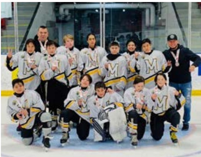
Maskwacis U13 Silver Medal Alberta Treaty Hockey Tournament April 18, 2023.