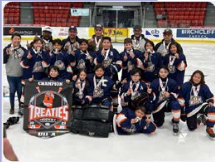
Attack U11 Gold Medal @ Alberta Treaty Hockey Tournament April 18, 2023.