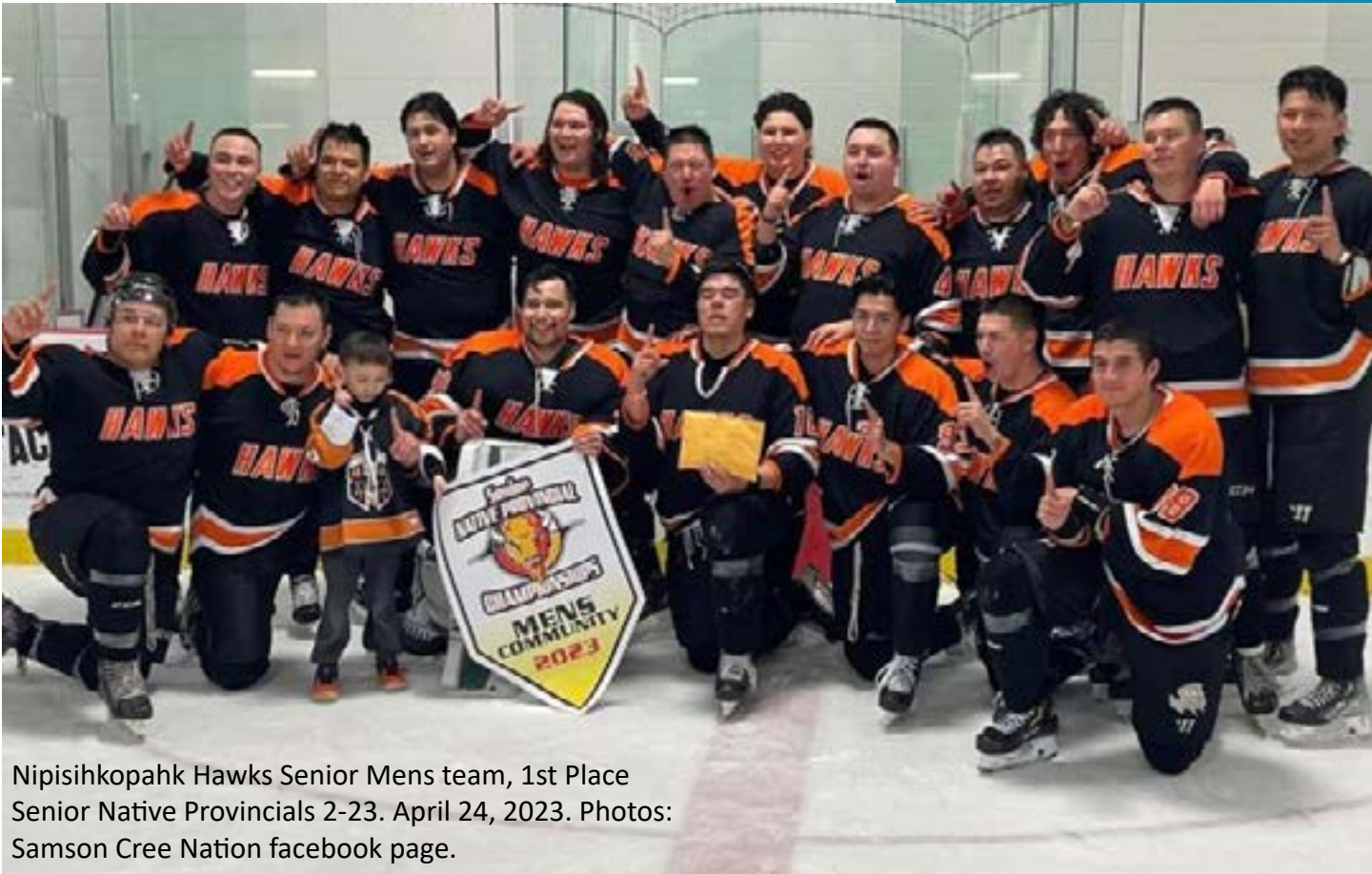
Nipisihkopahk Hawks Senior Mens team, 1st Place Senior Native Provincials 2-23. April 24, 2023.