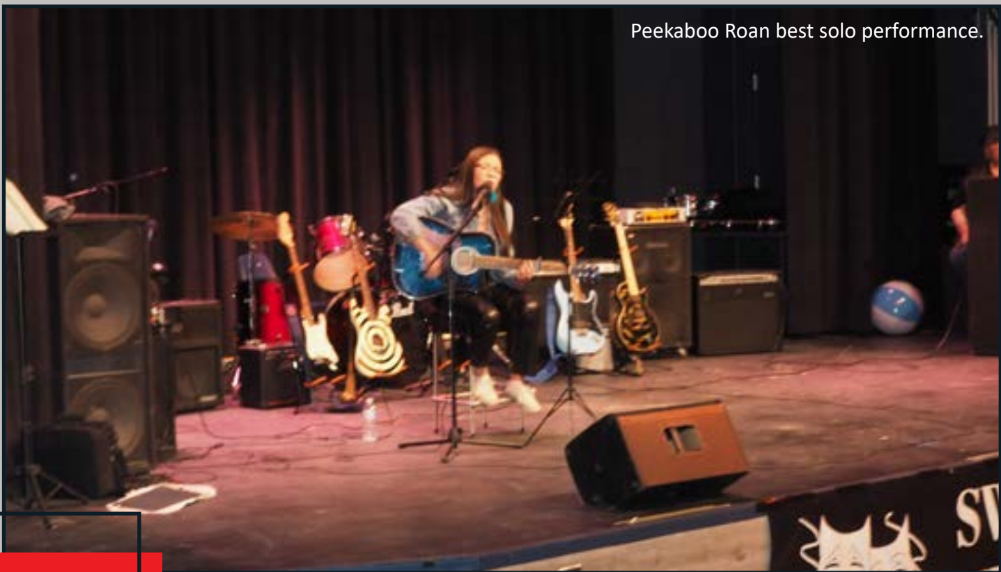
Peekaboo Roan best solo performance.