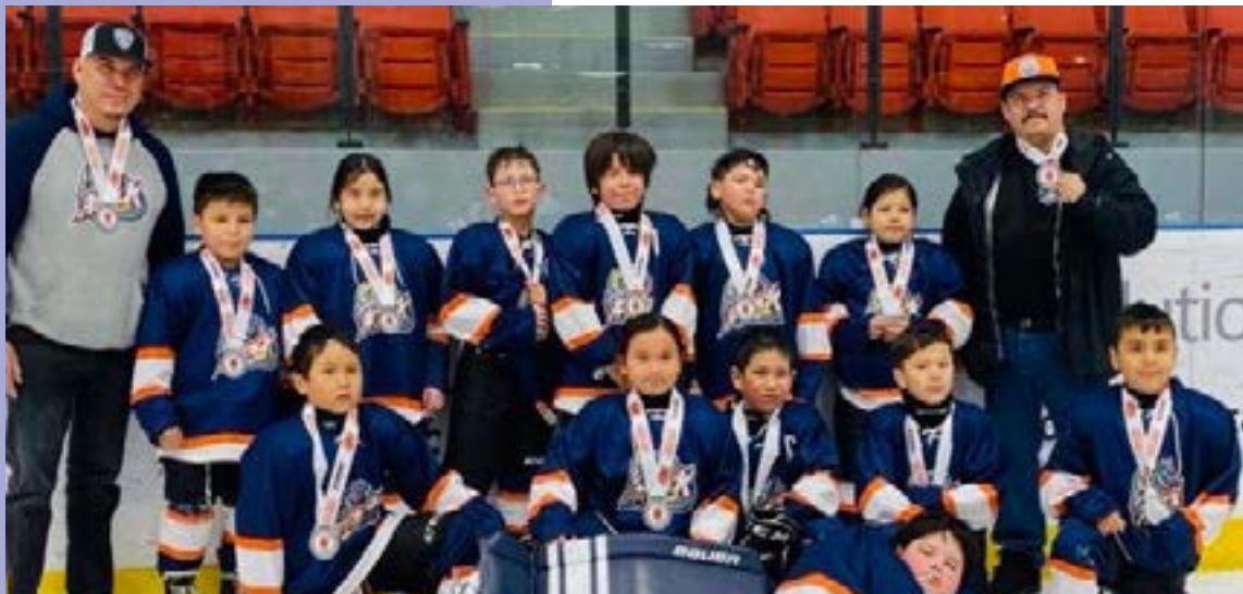
Maskwacis U9 Silver Medal Alberta Treaty Hockey Tournament April 18, 2023.