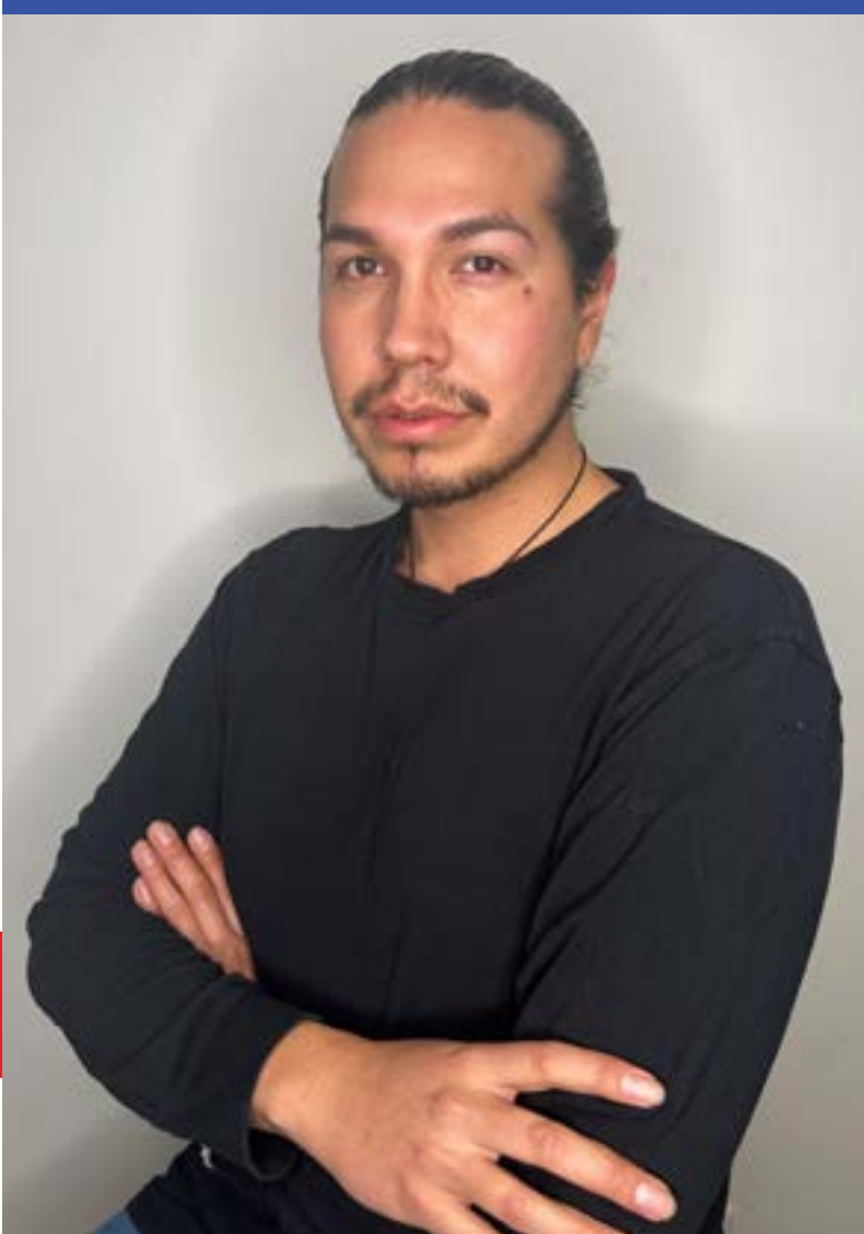
A Little About Myself