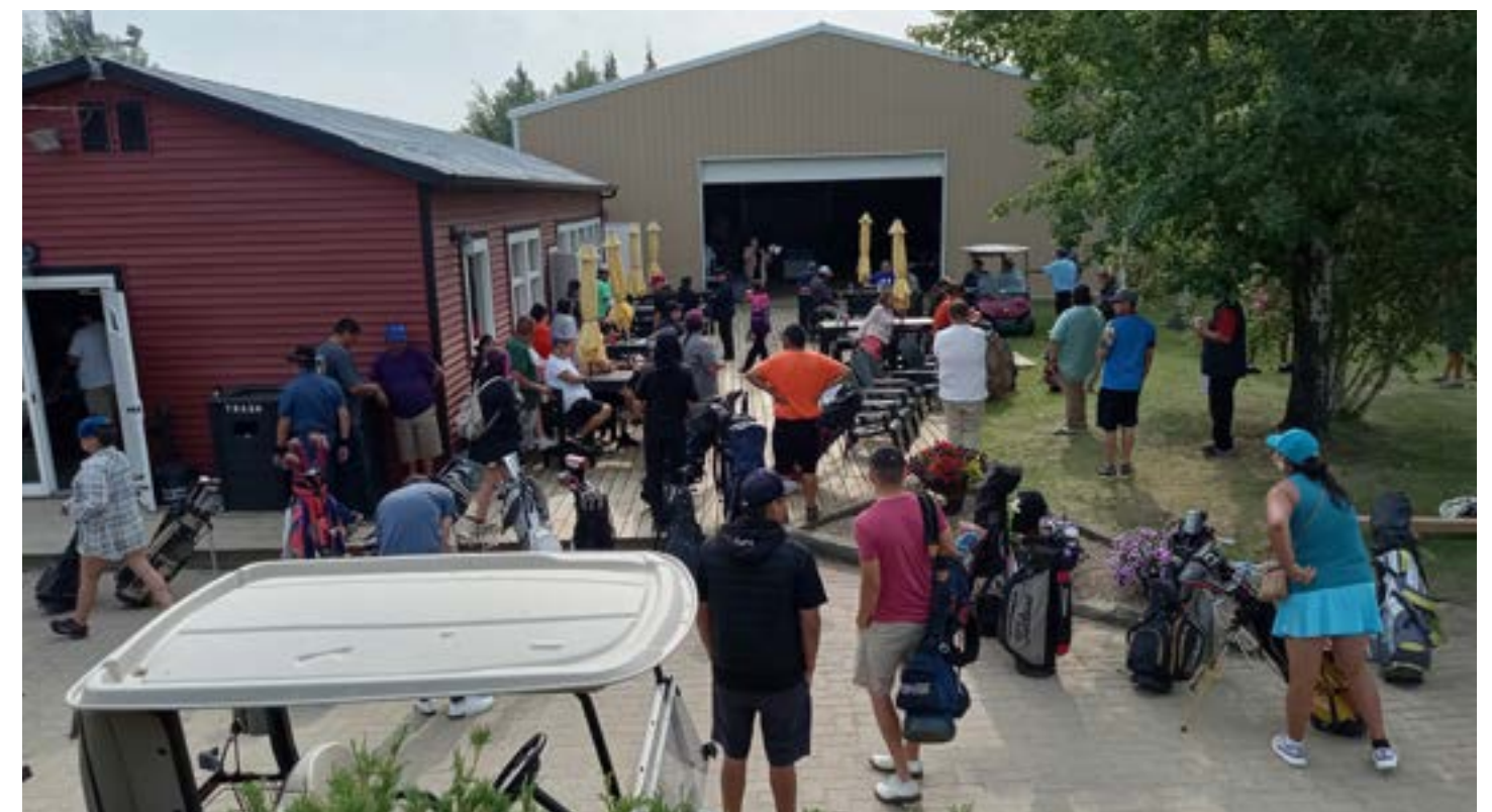
July 7, 2023, Black Bull golf course. Staff golf. Door prizes and dinner. Good job to the organizers.