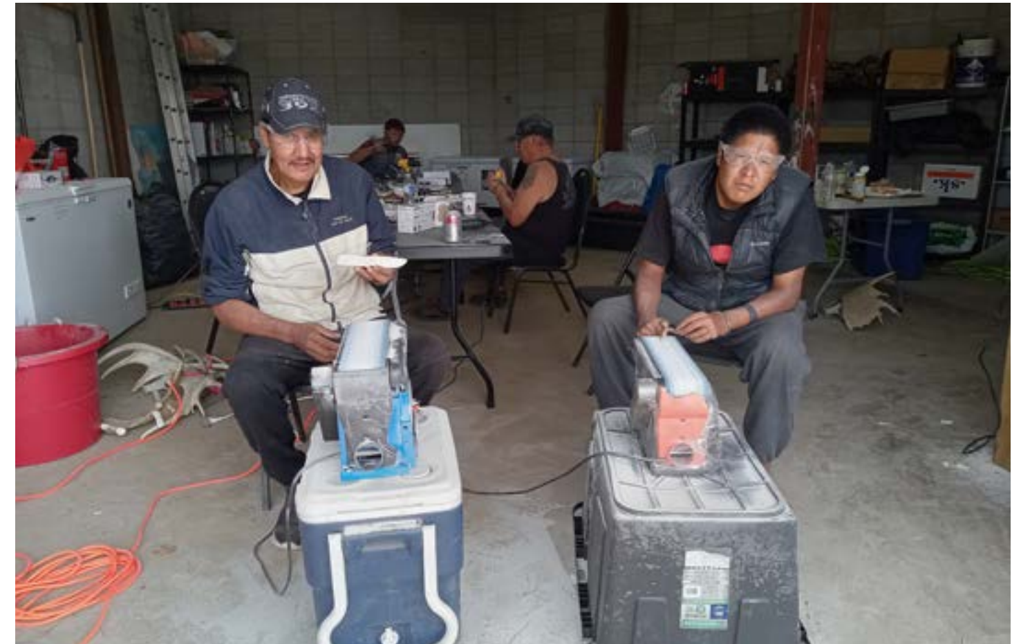
July 12, 2023, Men's Group project at the HBMC.